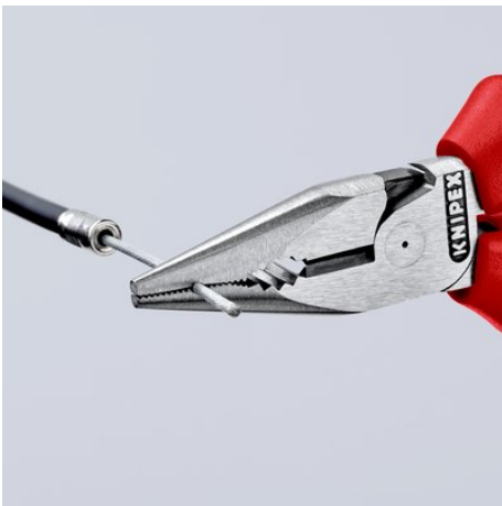
Milled groove in the gripping area